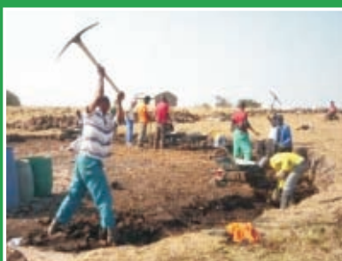
FOUNDATIONS FOR NEW SCHOOL (JULY 2008)