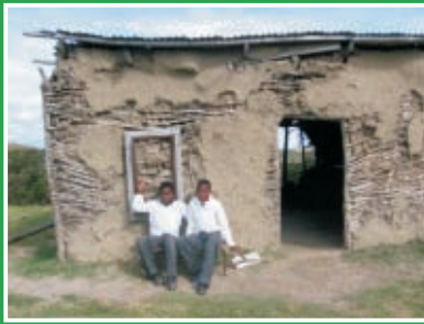
OLD SCHOOL (APRIL 2007)