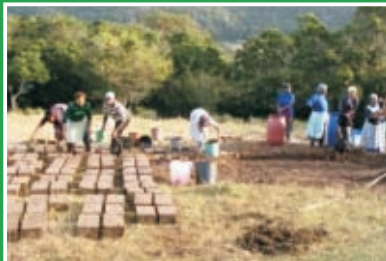
BRICK MAKING PROJECT