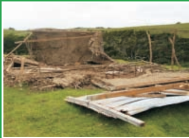
OLD SCHOOL COLLAPSED (DECEMBER 2007)